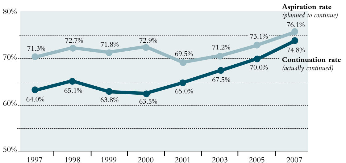
Figure 1. Vermont postsecondary education continuation rates