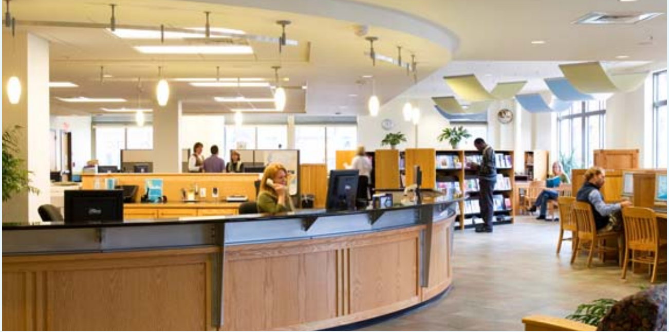
The VSAC Resource Center