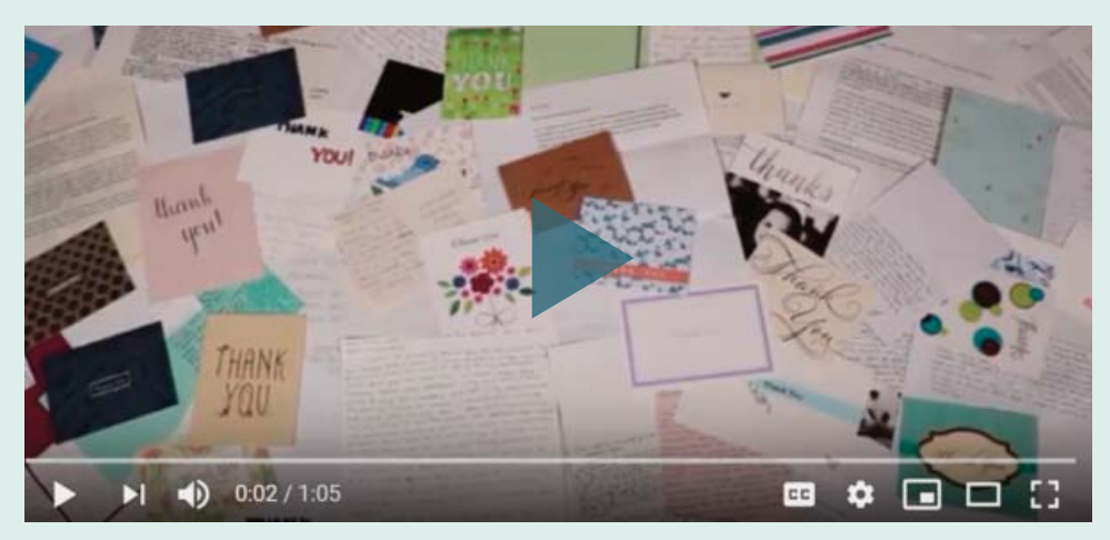
Giving Thanks for Vermont Scholarships: "Dear VSAC ... something as simple as a scholarship can really change a life and I will be forever grateful."