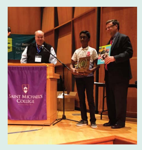
Vermont's top speller in the Scripps Spelling Bee gets $250 in a college savings account from VSAC.