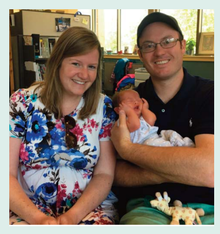
Babies born on 5/29 get $100 in a 529 account